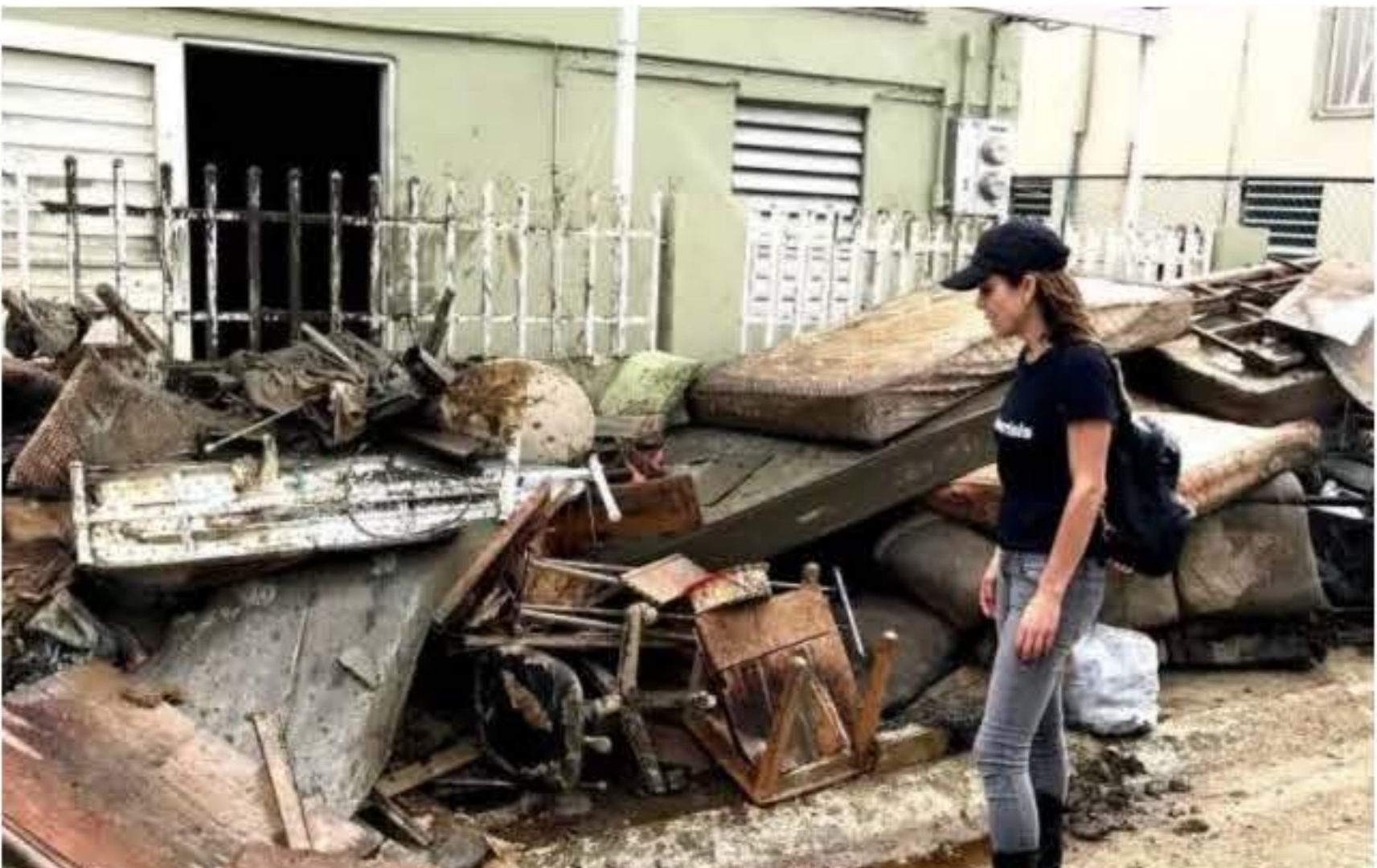
Bethenny Frankel on a visit to Puerto Rico Oct. 2.

BETHENNY'S NEW PARTNER: Bethenny Frankel is working with Delivering Good, formerly K.I.D.S./Fashion Delivers, on its disaster relief efforts. Frankel's B Strong program for women and their families in crisis has teamed with Delivering Good to provide gift cards, bank cards and critical supplies to people affected by the recent hurricanes.